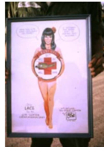
A cartoon drawing of “Miss Lace,” rendered in 1965 for the “Original DUSTOFF” 57 th Medical Detachment (Helicopter Ambulance) by the creator of “Steve Canyon,” cartoonist Milton Caniff.