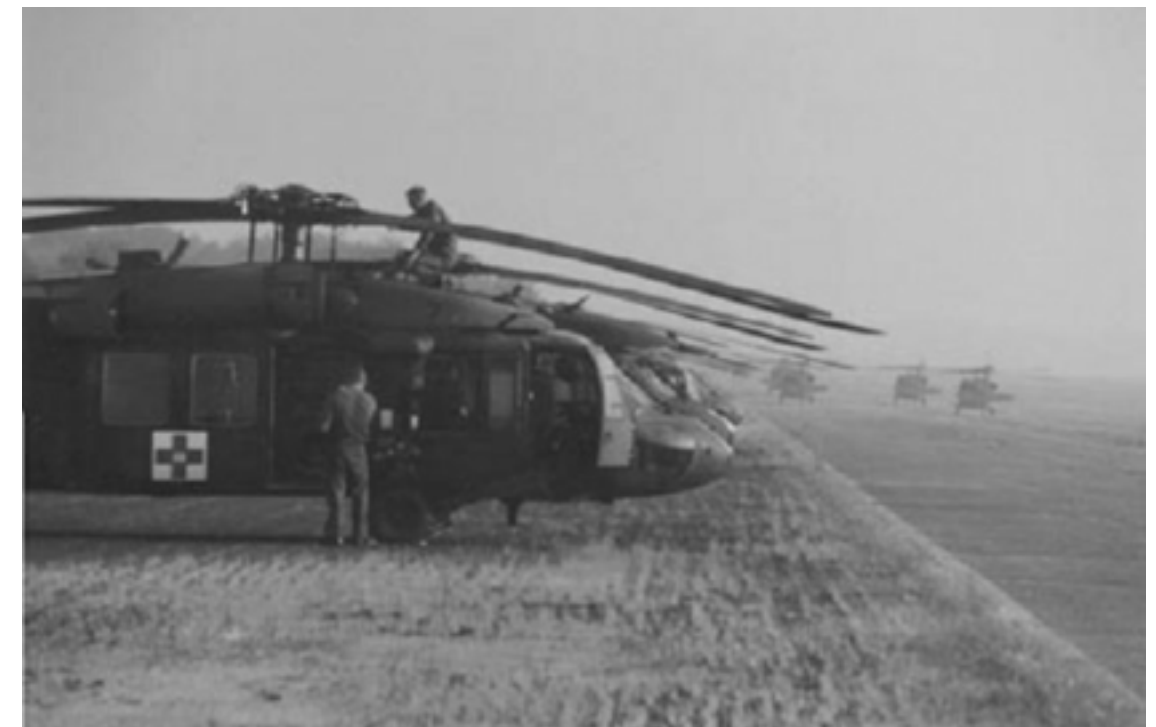
Flight line of the famous 498 TH Medical Company (Air Ambulance) in the Iraqi Desert.

DUSTOFF Association P. O. Box 8091 Wainwright Station San Antonio, TX 78208