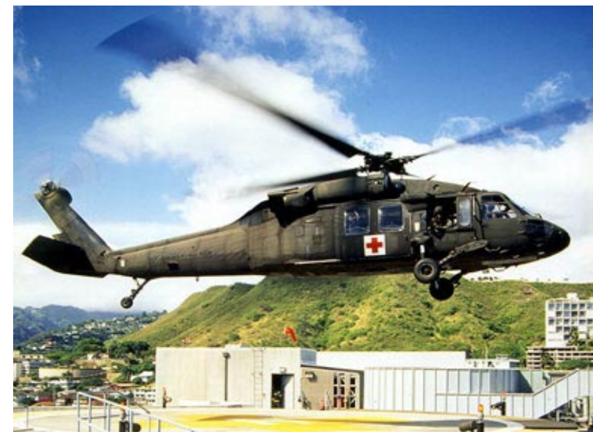
DUSTOFF Hawaii—Still flying.

That training includes drills, exercises, and time in a simulator—a mock cockpit mounted on pistons that can shimmy and shake just like a real helicopter. Pilots can practice flying with a near-perfect replication of the aerial experience, but without the hazards. Miller said it pays off daily, since this air ambulance unit is one of the most active in